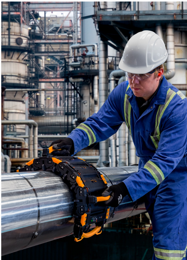
Inspect pipe outer diameters from 152 mm (6 in) up to flat surfaces