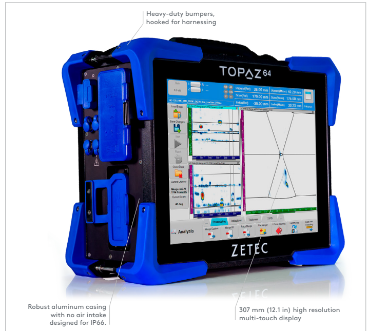
Figure 1: Annotated breakdown of TOPAZ64 showing its key features.